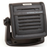
External Speaker Microphone SM09D1