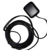
GPS Antenna (optional) GPS04