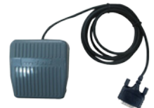
Foot Switch (External PTT) POA44