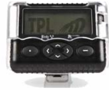
Plastic rigid holster