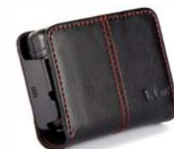
Horizontal leather magnetic holster