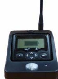
Charger with antenna output