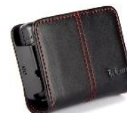
Leather horizontal holster